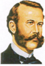
Jean Henry Dunant Founder of Red Cross 1828-1910